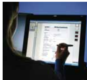
New! Rapid data entry with stylus tablet

Optional tablet PC for electronic form patient data entry